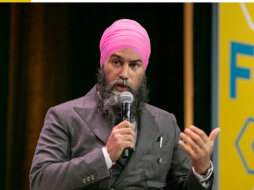
JAGMEET SINGH Leader of the New Democratic Party of Canada

"I really believe in mental health being a part of our healthcare system; we have to treat it like it's a healthcare issue. People need to have public access... municipalities cannot do it alone. You're being asked to do so much."