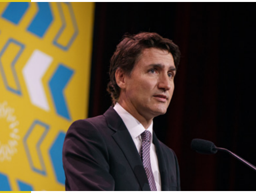
JUSTIN TRUDEAU Prime Minister of Canada

"We are taking a collaborative approach to addressing the housing crisis that treats municipalities as partners. To meet the needs of Canadians, all of us need to step up to confront the challenges ahead and be bold in our solutions."