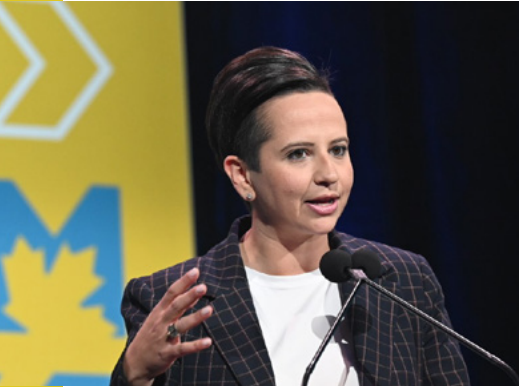
MELISSA LANTSMAN Deputy Leader of the Conservative Party of Canada

"I want to talk about housing not because it's at the core of what many of you do as municipalities... but because it is the core of what it means to be Canadian and what our country offers to so many people who come here."