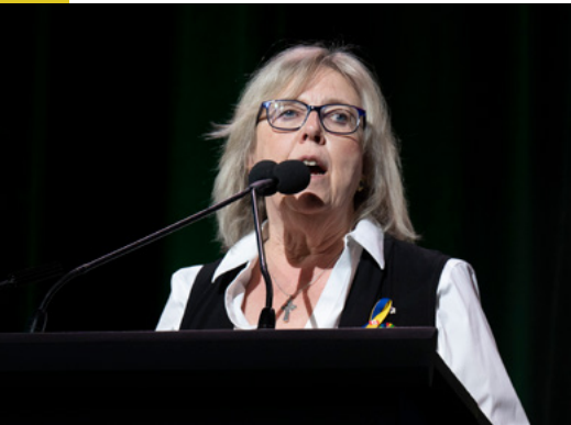
ELIZABETH MAY Leader of the Green Party of Canada

"The climate crisis is real. We are in a climate emergency... we are not acting like it's an emergency. We need to pull together around the same table and not after the next extreme weather event."